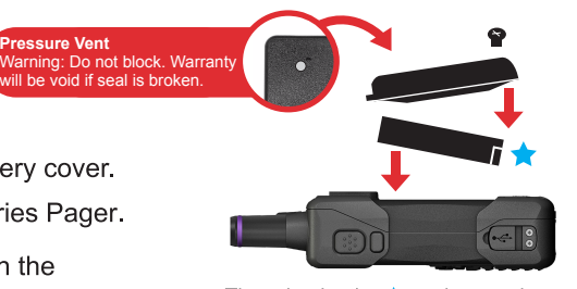
The edge by the * mark goes down.